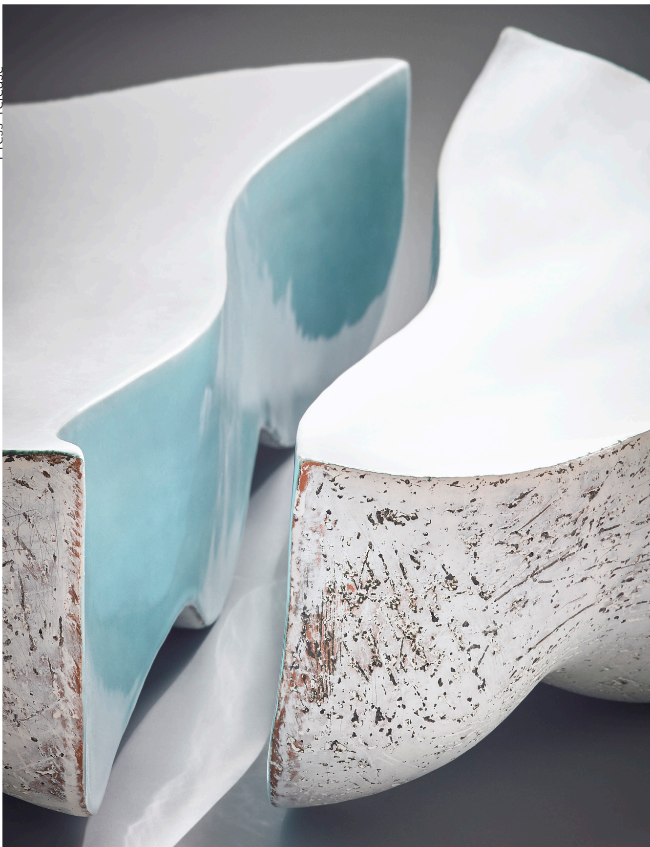
Untited, Stoneware, glazes 11 x 47 x 31 cm Unique