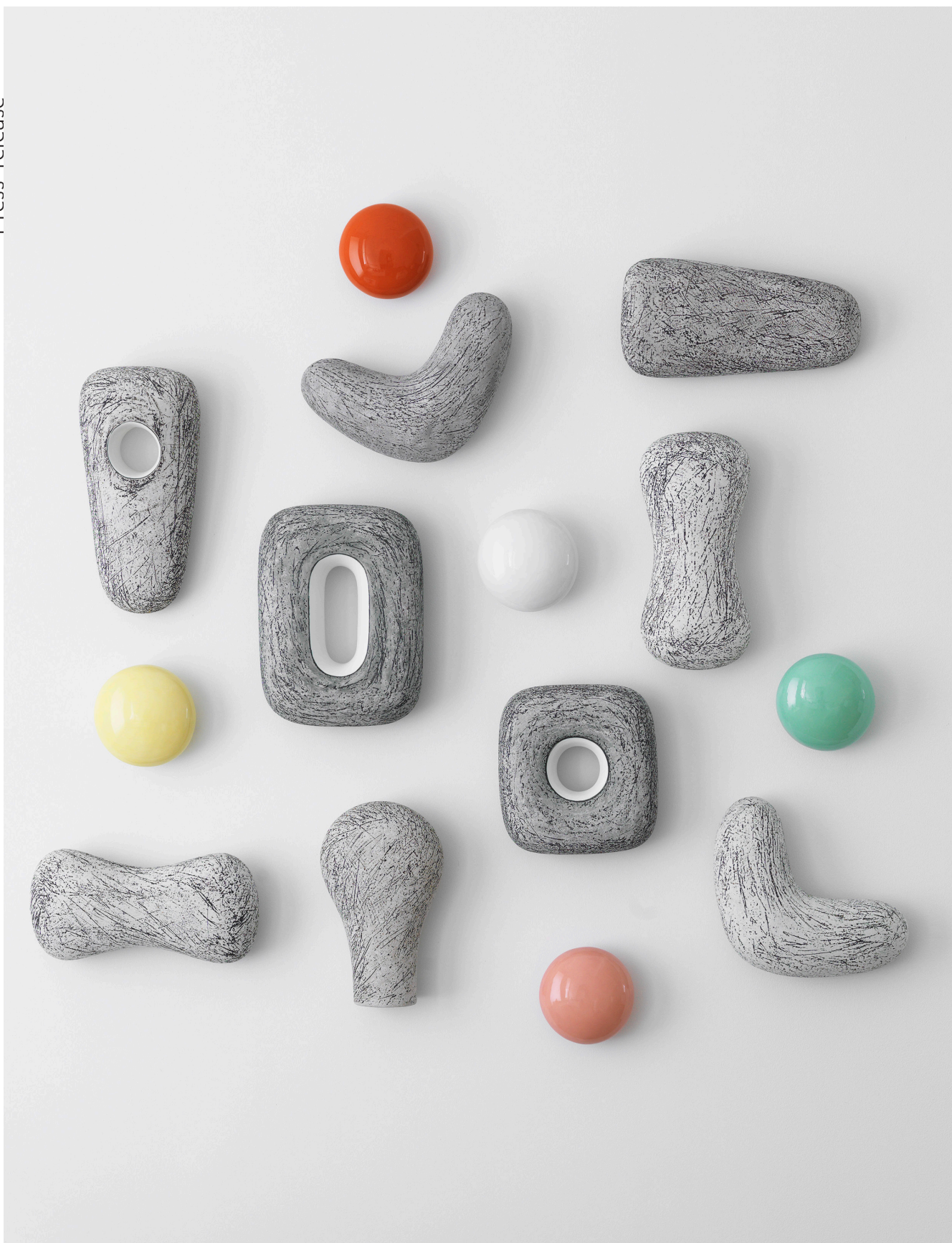
Untitled, wall piece Stoneware, glazes 126 x 140 x 12 cm Unique