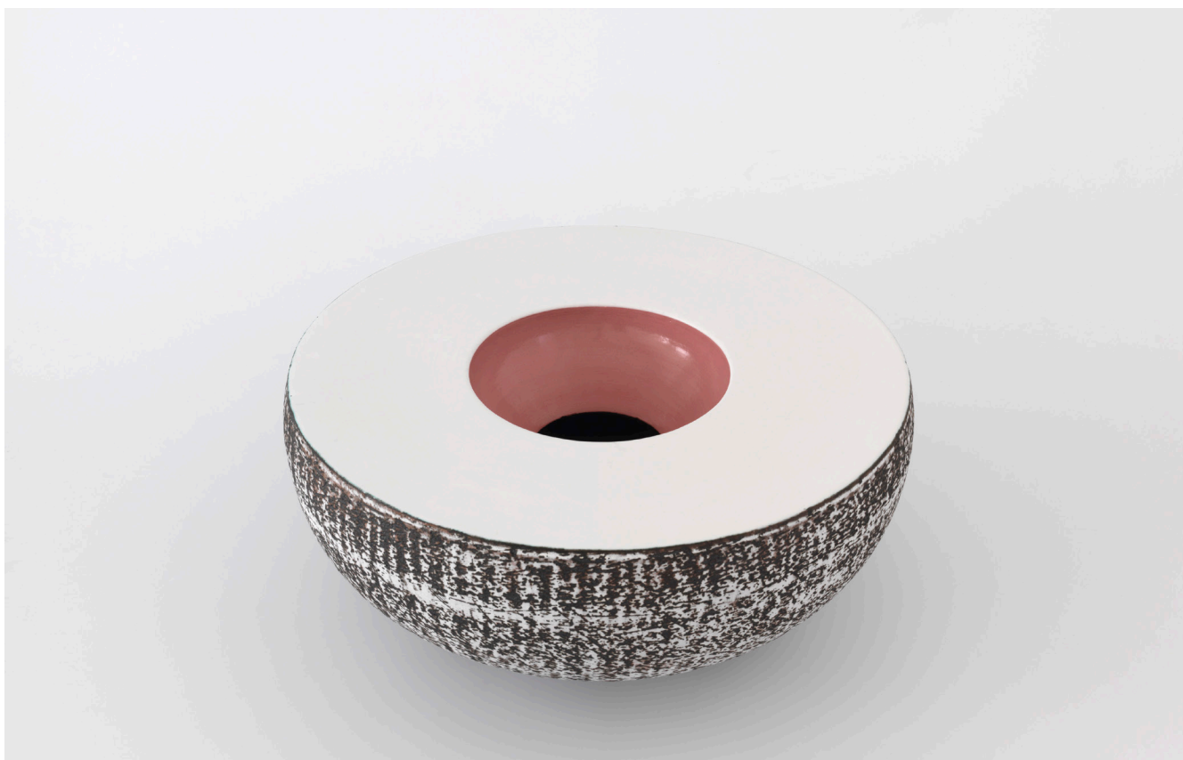
Cibles Stoneware, glazes 16,5 x 37,5 x 37,5 cm and 16,5 x 36,5 x 36,5 cm Unique